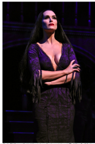
Brooke Shields in the Broadway Musical "The Addams Family"

Brooke Shields: People tell me I look like my dad, but looking at photos of my mother at my age, I think I look like her.