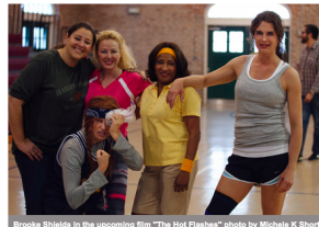
Brooke Shields in the upcoming film "The Hot Chick"

Brooke Shields: Every day is different depending on the project I am working on.